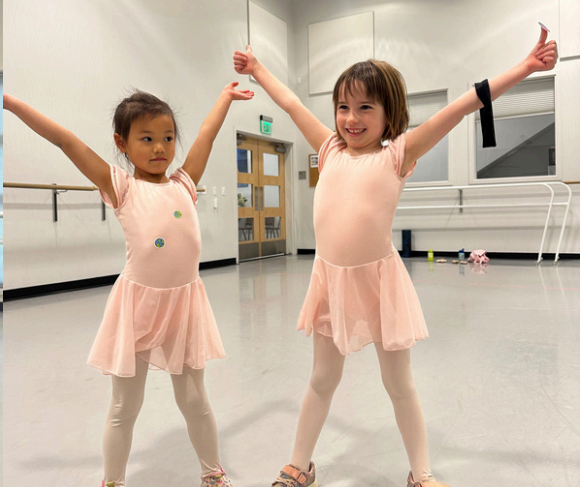
Dare Dance Collective 2024 – 2026